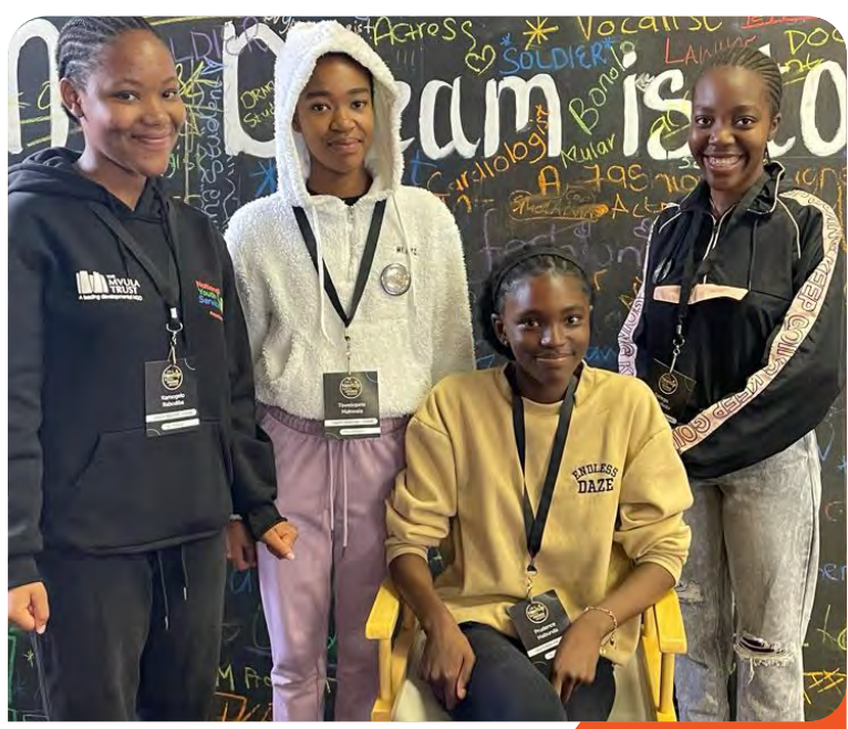
iSchoolAfrica Media Change Makers

In 2023 Dorothea Special School (Western Cape), an iSchoolAfrica programme school, became the first special needs school to be recognised as an Apple Distinguished School. This global award recognises the school as a centre of leadership and educational excellence.