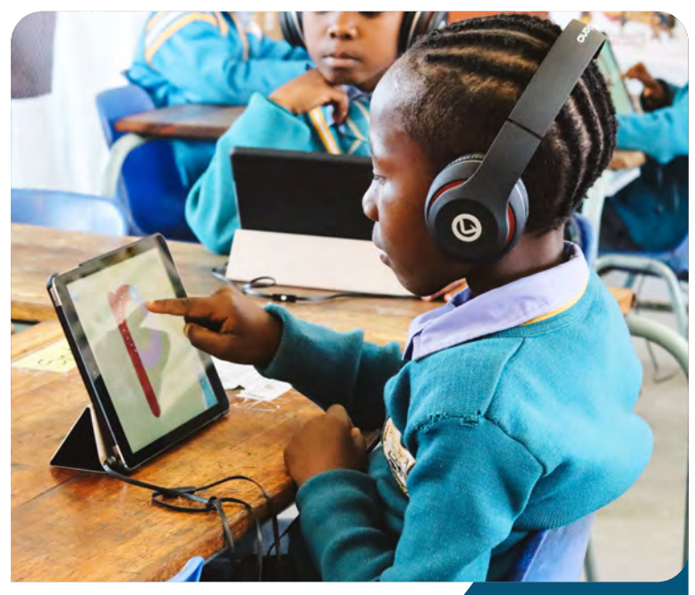
iSchoolAfrica Numeracy and Literacy Programme

The iSchoolAfrica Early Learning Programme is designed to support the NCF and CAPS curriculum frameworks by allowing teachers and learners to interact with social stories and learn-through-play activities.