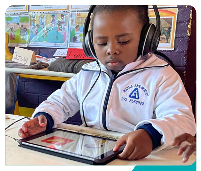
iSchoolAfrica Early Learning Programme

A child's early years are the foundation for future development , providing a strong base for all learning abilities, including cognitive and social development.